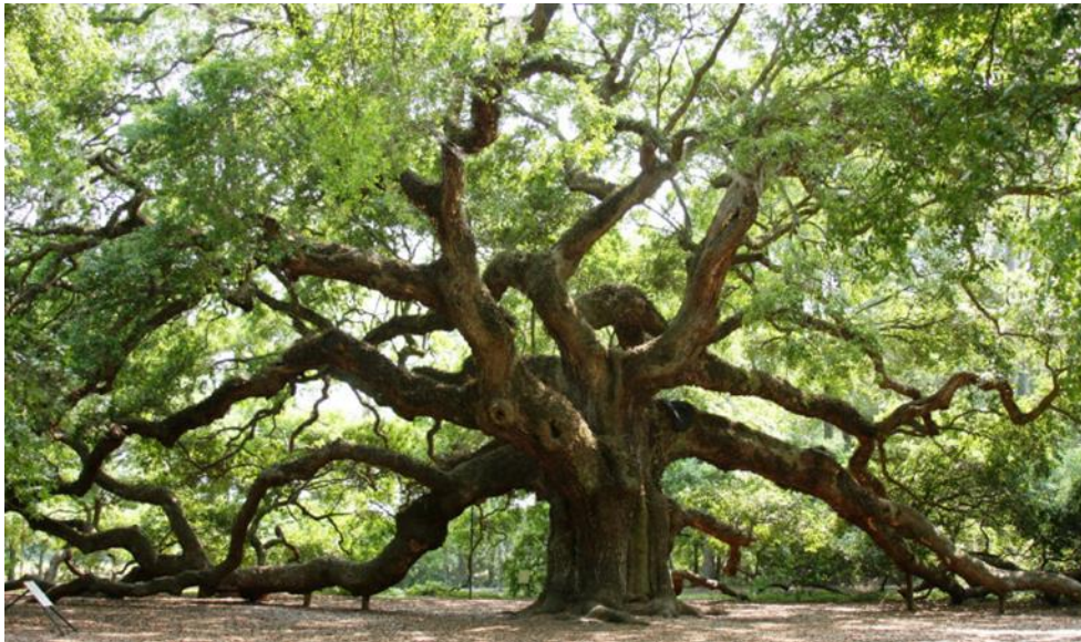
THE ANGEL OAK

There is a tree just outside the city of Charleston, South Carolina called the Angel Oak, and it's incredibly large. Its trunk is 28 feet in diameter. When the sun is directly above the tree, its crown shades over 17,000 square feet. Its longest limb is 187 feet long. The Angel Oak is a large tree.